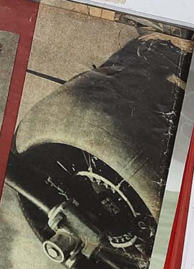
9-503 - Tools for the WWII Jeep, Ford GPM, Willys MB