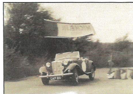
Patrick at the wheel of the TD when he used to race it in the 60s