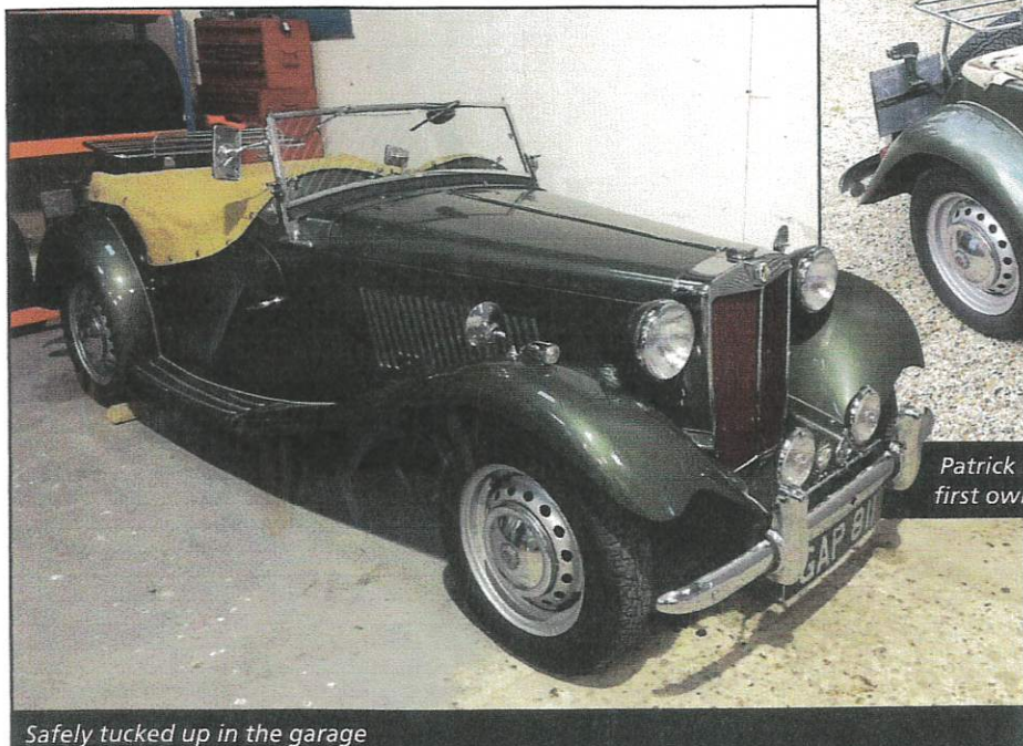
Safely tucked up in the garage